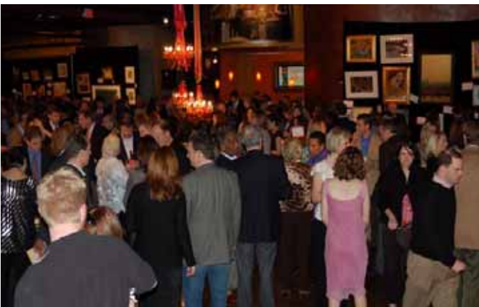
The auction, which was sold out in advance, was attended by more than 725 people and featured over 275 pieces of art from top regional artists.

The eighth annual Art With Heart art auction, held Feb. 2 at CenterStage@NoDa, grossed $138,000 for United Family Services' domestic violence programs and topped all previous records for proceeds and attendance.